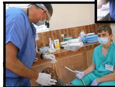
BBW Dental Clinic