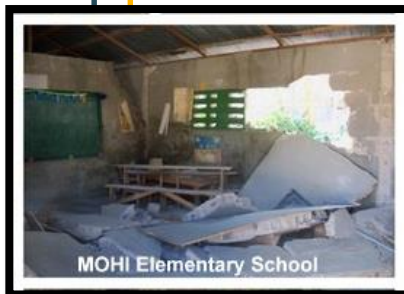
MOHI Elementary School