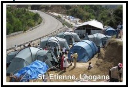
St. Etienne, Léogane

and prayed for the families left behind to mourn them. We gave thanks for all the blessings God has given us. Only He could bring such beauty from ashes. We see His hand all around as we continue to rebuild.