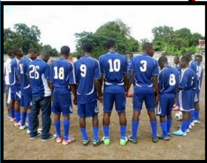
The MOHI soccer team played its first two matches this month. A big thank you to Covenant Day school for outfitting them for their games.